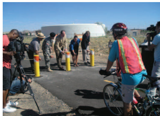
Mayor Berry and other local dignitaries cut the ribbon at the official opening of the Paseo de la Mesa Open Space recreation trail, 12 August, 2010

Please note that the Paseo de la Mesa Trail is recommended for advanced riders and hikers. Use caution, bring plenty of water, and always wear your helmet!