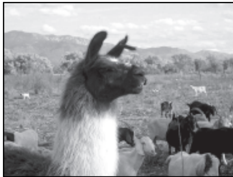
Arnold the llama looking after the herd

The goat project started through the efforts of the late Representative Ray Ruiz in the 2003 Legislature. Funding of $100,000 was provided, split evenly between a goat herd on 200 acres of Middle Rio Grande Conservancy District owned land in Socorro County,