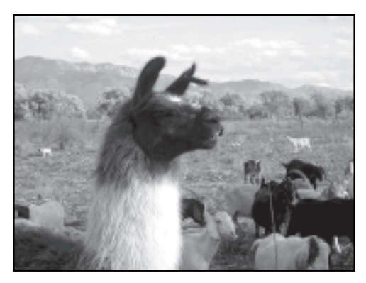
Arnold the llama looking after the herd

The goat project started through the efforts of the late Representative Ray Ruiz in the 2003 Legislature. Funding of $100,000 was provided, split evenly between a goat herd on 200 acres of Middle Rio Grande Conservancy District owned land in Socorro County,