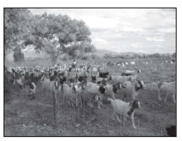
On the search for more salt cedar and Russian olive