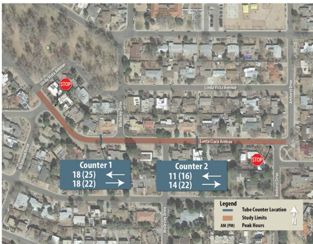
Figure 1: Project Area and Existing Traffic Volumes

The Santa Clara Avenue project is located in Albuquerque, New Mexico and is approximately 0.27 miles (1,400 feet) in length. Santa Clara Avenue is a two-lane, undivided local street that runs east-west, from Linda Vista Avenue to Amherst Drive. Linda Vista Avenue is a two-lane, undivided local street that runs east-west and intersects the west end of Santa Clara Avenue. Amherst Drive is a two-lane, undivided local street that runs north-south and intersects Santa Clara Avenue on the east end. See Figure 1 for a map of the project area.