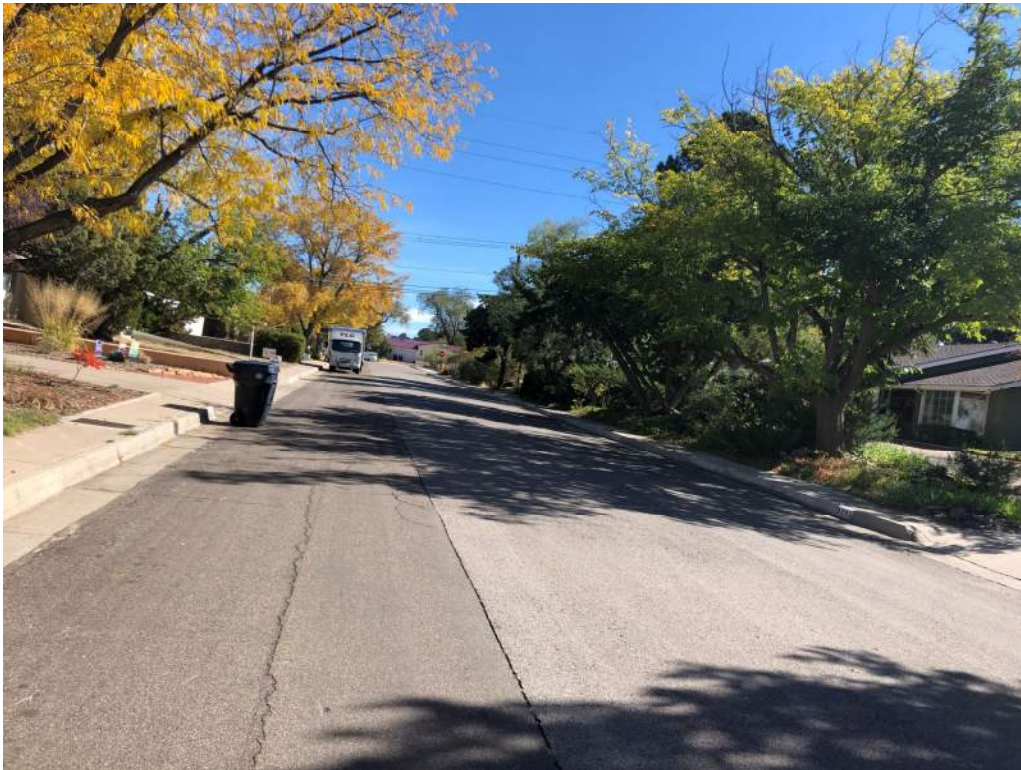
Figure 3: Santa Clara Avenue looking east

Santa Clara Avenue is a 32-ft wide roadway with curb and gutter and 4-ft wide sidewalks. See Figure 3 and Figure 4 for photos of the existing roadway, and Figure 5 for the existing Santa Clara Avenue typical section.