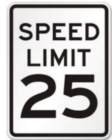
Figure 2: Santa Clara Avenue Speed Limit

Speed data was collected on Santa Clara Avenue for a 48-hour period. See Table 2 for the 85 th -Percentile speeds for Santa Clara Avenue.