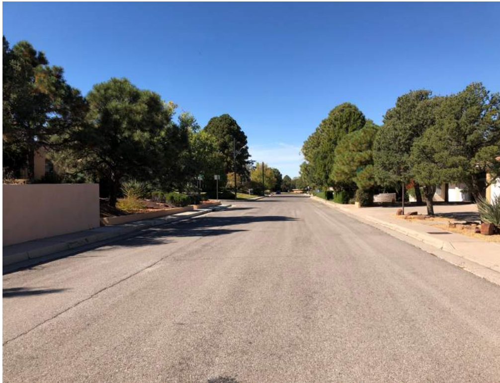
Figure 4: Santa Clara Avenue looking west