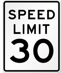
Figure 2: Morris Street Speed Limit

Morris Street is a 40-ft wide roadway with bicycle lanes in each direction, curb and gutter and 4-ft wide sidewalks. See Figure 3 and Figure 4 for photos of the existing roadway, and Figure 5 for the existing Morris Street typical section.