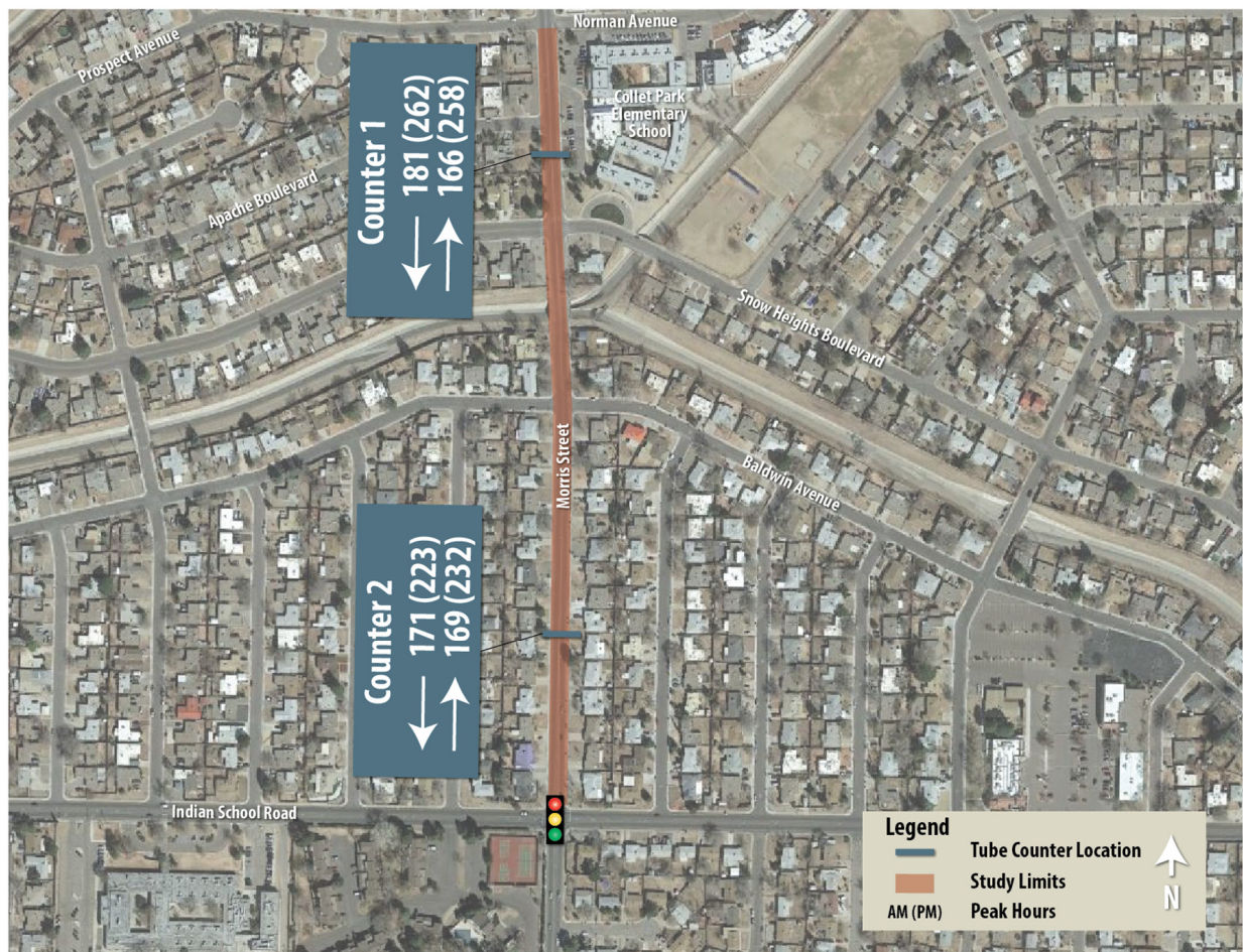
Figure 1: Project Area and Existing Traffic Volumes

The Morris Street project is located in Albuquerque, New Mexico and is approximately 0.38 miles (2,009 feet) in length. Morris Street is a two-lane, undivided collector street that runs north-south, from Prospect Avenue/Norman Avenue to Indian School Road. Prospect Avenue/Norman Avenue is a two-lane, undivided local street that runs east-west and intersects the north end of Morris Street. Indian School Road is a three-lane, undivided minor arterial that runs east-west and intersects Morris Street at a signalized intersection. See Figure 1 for a map of the project area.