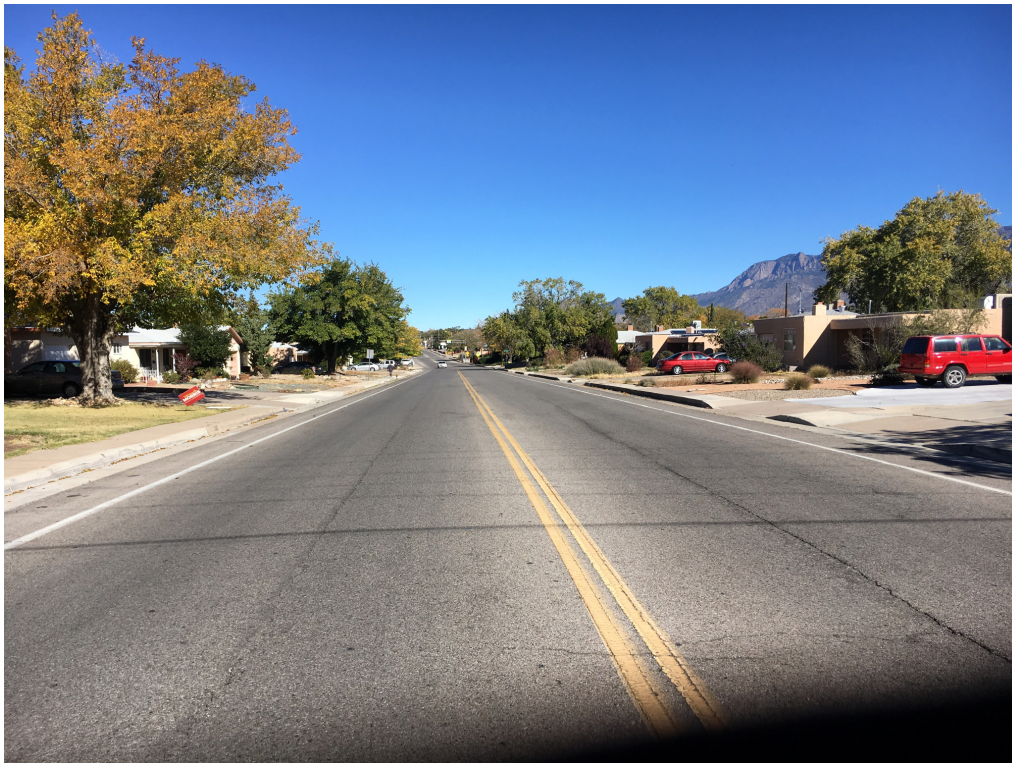
Figure 3: Morris Street looking north