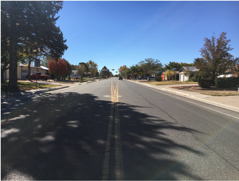
Figure 4: Morris Street looking south