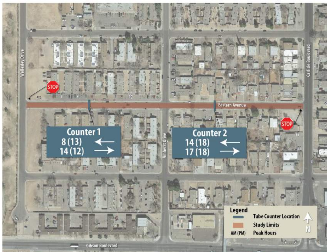
Figure 1: Project Area and Existing Traffic Volumes

The Eastern Avenue project is located in Albuquerque, New Mexico and is approximately 0.25 miles (1,318 feet) in length. Eastern Avenue is a two-lane, undivided local street that runs east-west, from Wellesley Drive to Carlisle Boulevard. Wellesley Drive is a two-lane, undivided local street that runs north-south and intersects the west end of Eastern Avenue at a T-intersection. Carlisle Boulevard is a two-lane, undivided minor arterial that runs north-south and intersects the east end of Eastern Avenue at a T-intersection. See Figure 1 for a map of the project area.