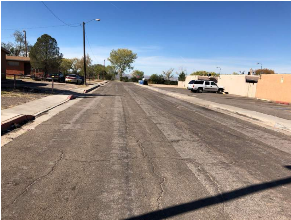
Figure 4: Eastern Avenue looking west