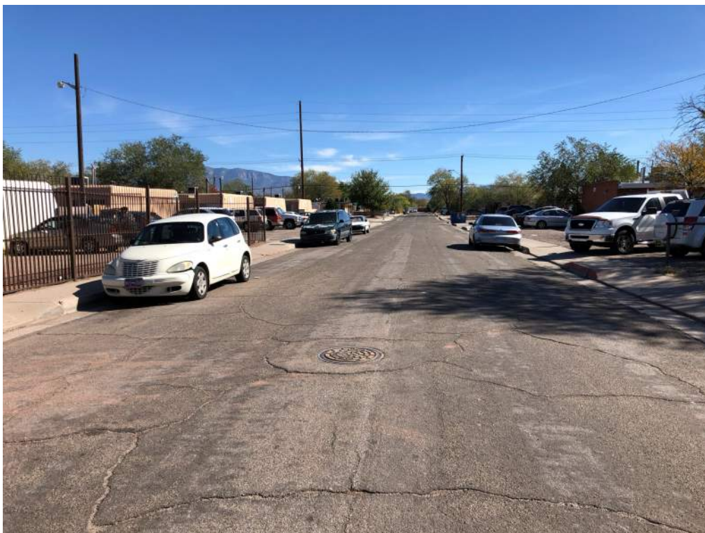
Figure 3: Eastern Avenue looking east