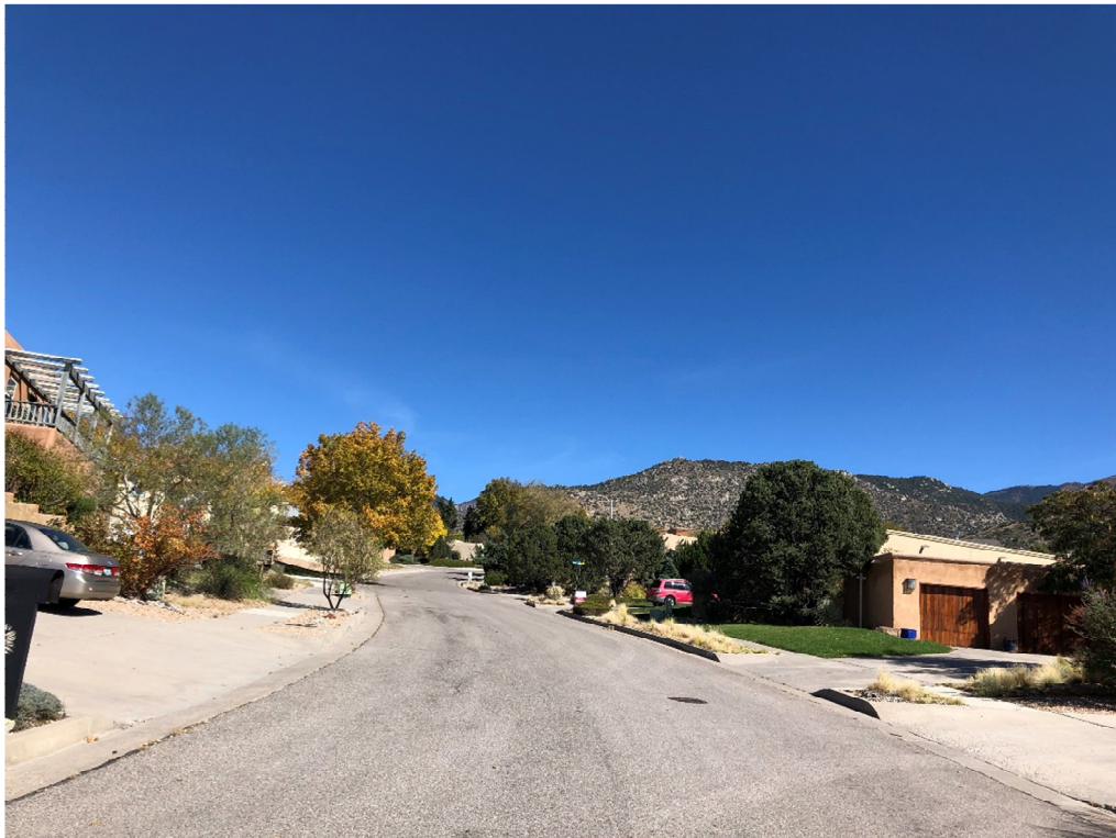
Figure 5: Della Longa Lane looking east