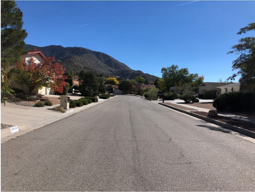
Figure 4: Calle de Tierra looking south