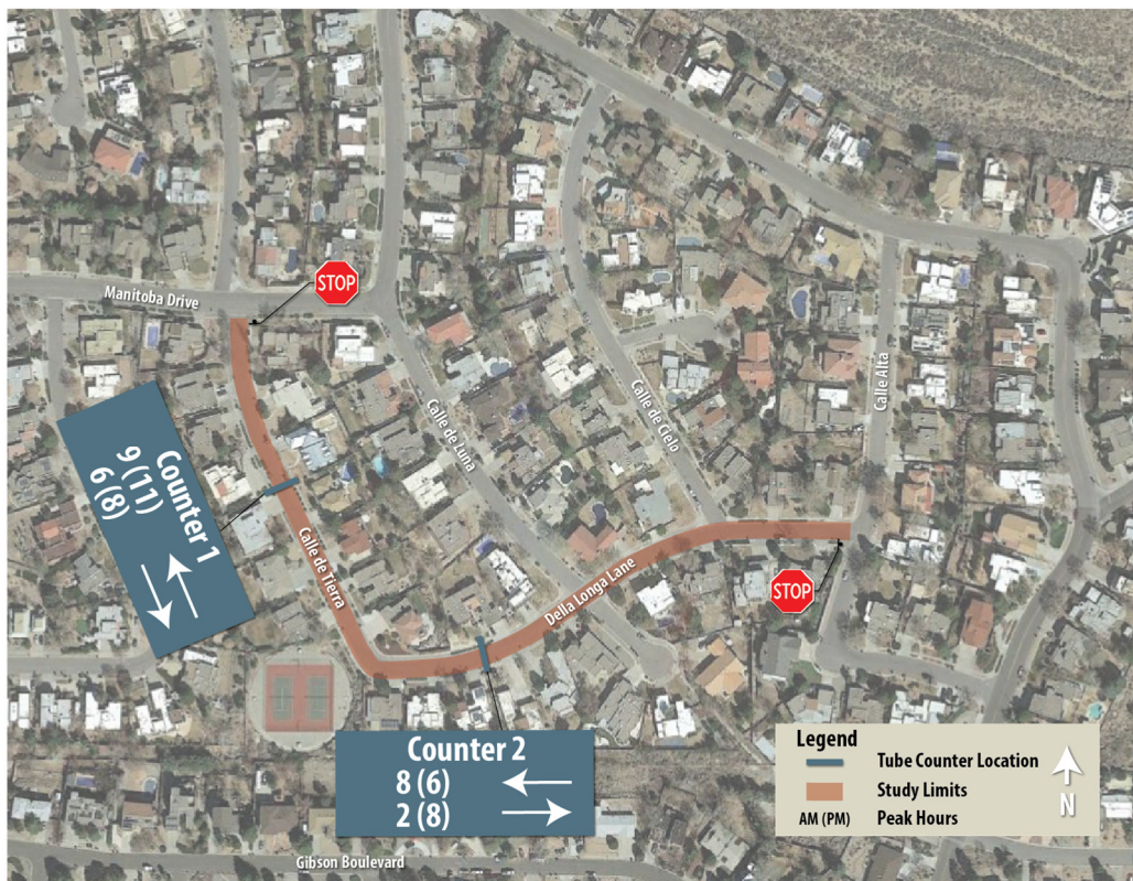
Figure 1: Project Area and Existing Traffic Volumes

The Calle de Tierra/Della Longa Lane project is located in Albuquerque, New Mexico and is approximately 0.31 miles (1,645 feet) in length. Calle de Tierra Lane is a two-lane, undivided local street that runs north-south, from Manitoba Drive and then curves into Della Longa Lane, an east-west local street. Manitoba Drive is a two-lane, undivided local street that runs east-west and intersects the north end of Calle de Tierra/Della Longa Lane. Calle Alta a two-lane, undivided local street that runs north-south and intersects Calle de Tierra/Della Longa Lane from the east at a T-intersection. See Figure 1 for a map of the project area.