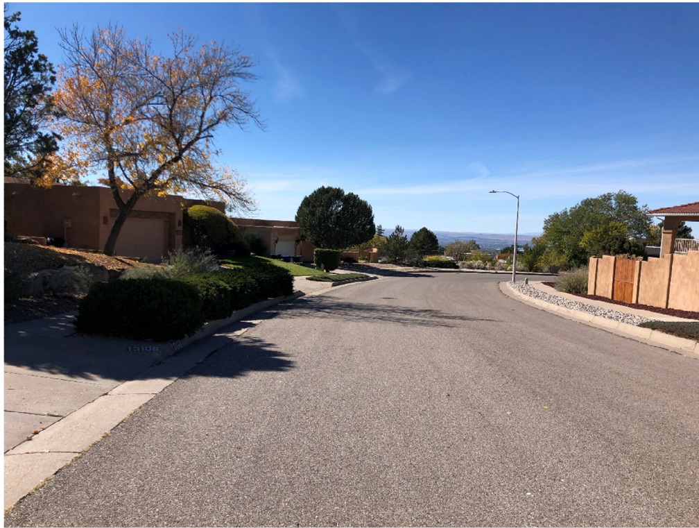
Figure 6: Della Longa Lane looking west