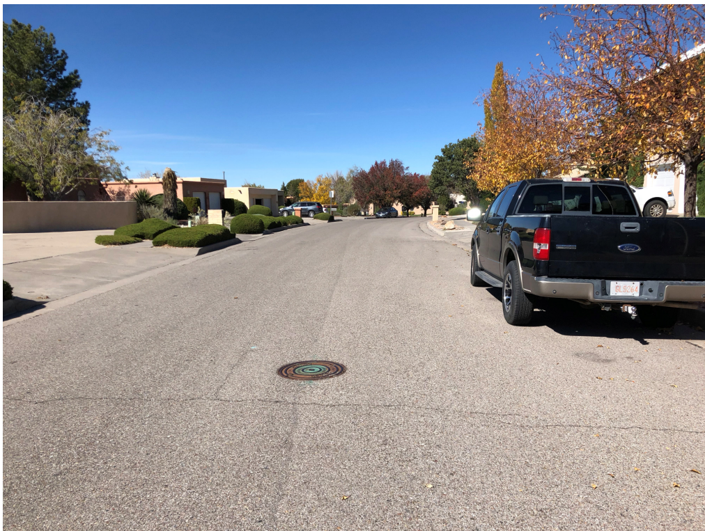
Figure 3: Calle de Tierra looking north