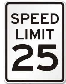
Figure 2: Calle de Tierra/Della Longa Lane Speed Limit

Calle de Tierra/Della Longa Lane is a 28-ft wide roadway with curb and gutter and 4-ft wide sidewalks. See Figure 3 and Figure 4 for photos of the existing roadway, and Figure 5 for the existing Calle de Tierra/Della Longa Lane typical section.