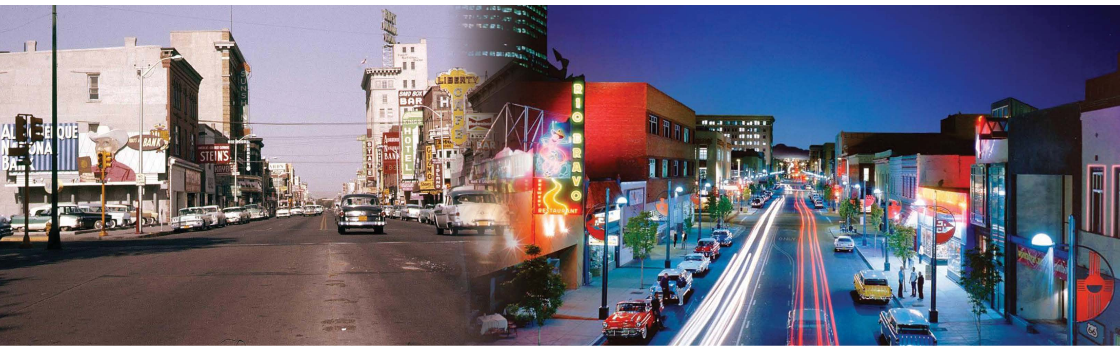
Route 66 in Downtown Albuquerque from 1958 to Present