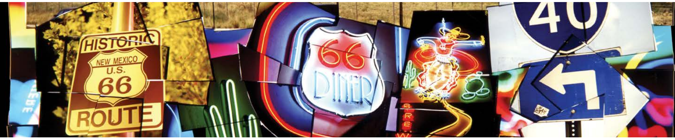
Historic Route 66 Photo Collage