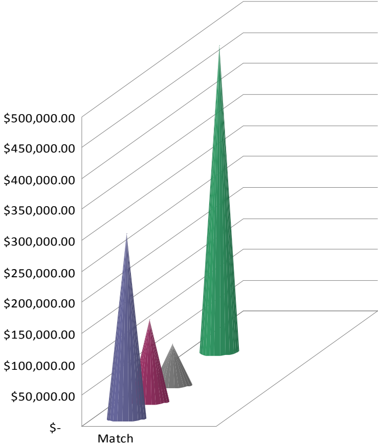
Match Chart 2012-2013