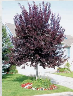
CANADA RED CHOKECHERRY