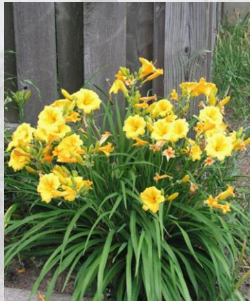
STELLA D' ORO DAYLILY