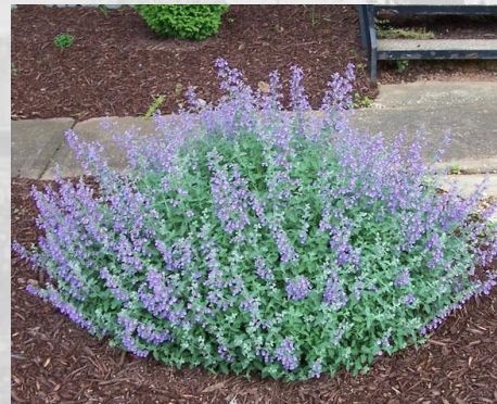
WALKER'S CAT MINT