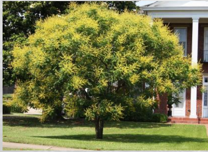
GOLDEN RAIN TREE