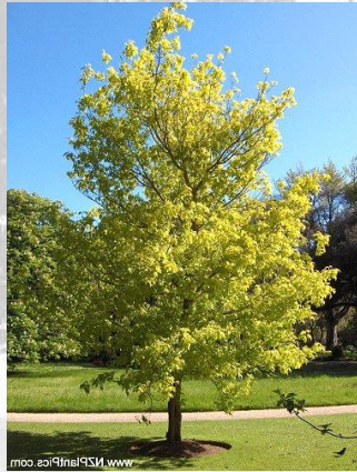
SENSATION BOX ELDER