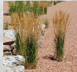
KARL FOERSTER GRASS