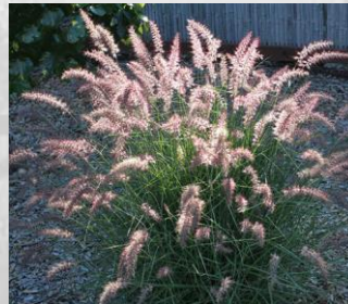
KARLEY ROSE FOUNTAIN GRASS