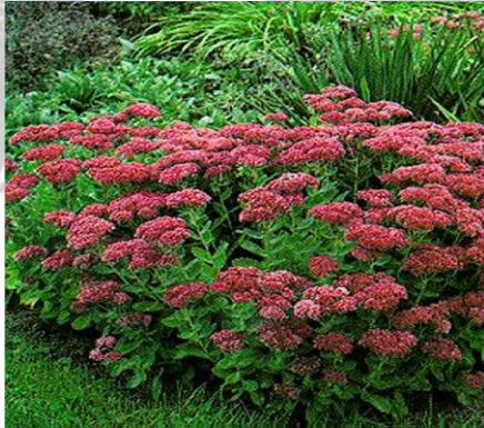
AUTUMN JOY SEDIUM