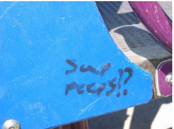
Korean War Veterans Park: Missing park sign, graffiti