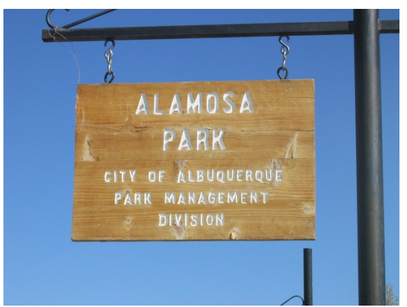
<u>Alamosa Park:</u> Graffiti on playground equipment