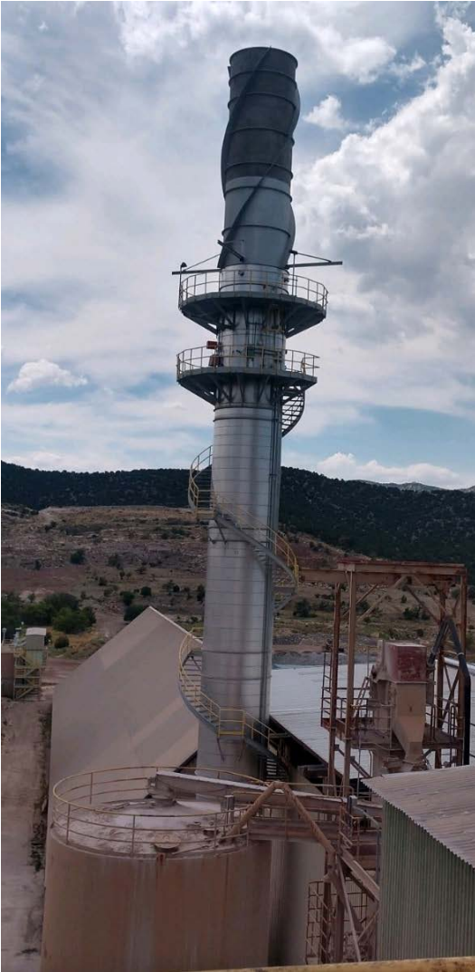
Figure C-1: GCC stack. A stack test is performed by inserting equipment through a "port" located at one of the circular observation decks visible on the stack.

A stack test entails direct sampling of SO 2 passing through the stack over short periods of time (such as one hour). GCC averages together the amount of SO 2 measured across multiple stack tests. GCC then uses this result to generate an emissions factor that appropriately characterizes the rate at which GCC's cement production processes emit SO 2 . GCC multiplies the emissions factor by an activities factor to estimate annual emissions from the stack. EHD judges this method to be acceptable for emissions inventory purposes.