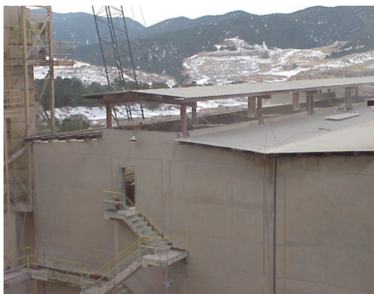
Figure C-3: former GCC baghouse, exterior

In the period 2003 to 2004, a GCC technician sampled the SO 2 concentration inside the baghouse a total of three times. The technician did so by pushing a cart loaded with measuring equipment through the baghouse. Based on each sample of the SO 2 gas diffusing through the interior, GCC estimated the rate at which production processes were emitting SO 2 . GCC averaged the amount of the three samples together to obtain a final emission factor. Extrapolating from a sample to an emission factor was more difficult than with a stack test because the samples were not from a concentrated, confined SO 2 stream. Instead, inside the bag house, the SO 2 gas was more scattered. Thus, more analysis was required to estimate how the production activity at the facility eventually resulted in the observed SO 2 concentrations. However, GCC did perform the analysis and arrived at a final emission factor. It used that factor in emissions inventory reporting to EHD for emission that occurred in the years 2004 to 2017, with no further sampling of SO 2 inside the baghouse. No further sampling was needed because the data obtained in 2003 and 2004 continued to be representative of the facility's SO 2 emissions characteristics in the years afterward.