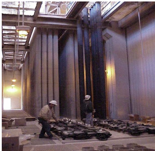
Figure C-2: former GCC baghouse, interior. A GCC employee pushed a cart loaded with emissions sampling equipment through this space to gather data for emissions calculations.

The method used by GCC to obtain an emissions factor prior to 2018 was not a stack test but instead an acceptable alternative. GCC first developed this alternative in 2003 and 2004 because at that time the facility did not have a stack (instead it emitted contaminants through a vented baghouse). Thus, stack tests were not physically possible. EHD will refer to this earlier method as the "alternative method." Instead of a stack test, which samples a concentrated emissions stream inside a confined, tube-shaped space, the alternative method sampled diffuse SO 2 gas in a large, open space within a portion of the GCC facility. This space was the interior of a "baghouse," which is a large structure for trapping contaminants prior to entering the exterior atmosphere. The baghouse structure that was used by GCC was designed to capture particulate matter from the cement manufacturing process using an array of filters or "bags". After the particulate matter was filtered, the emissions were then discharged into the atmosphere through a series of vents located near the roof of the baghouse. This baghouse has since been replaced by a newer one. Figure C-2, below, shows the interior of the former baghouse during the time GCC was using the alternative method for estimating emissions factors. Figure C-3, below, shows the exterior of the former baghouse. It should be noted that the baghouse is not used to control SO 2 emissions.