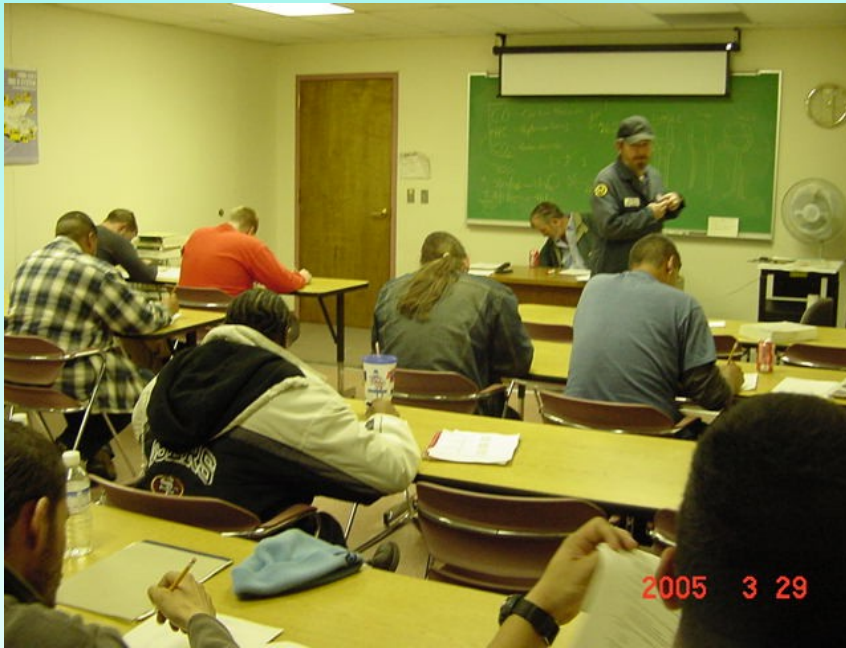
2 days classroom