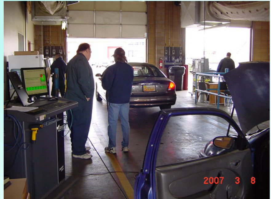
1 to 3 days practical testing