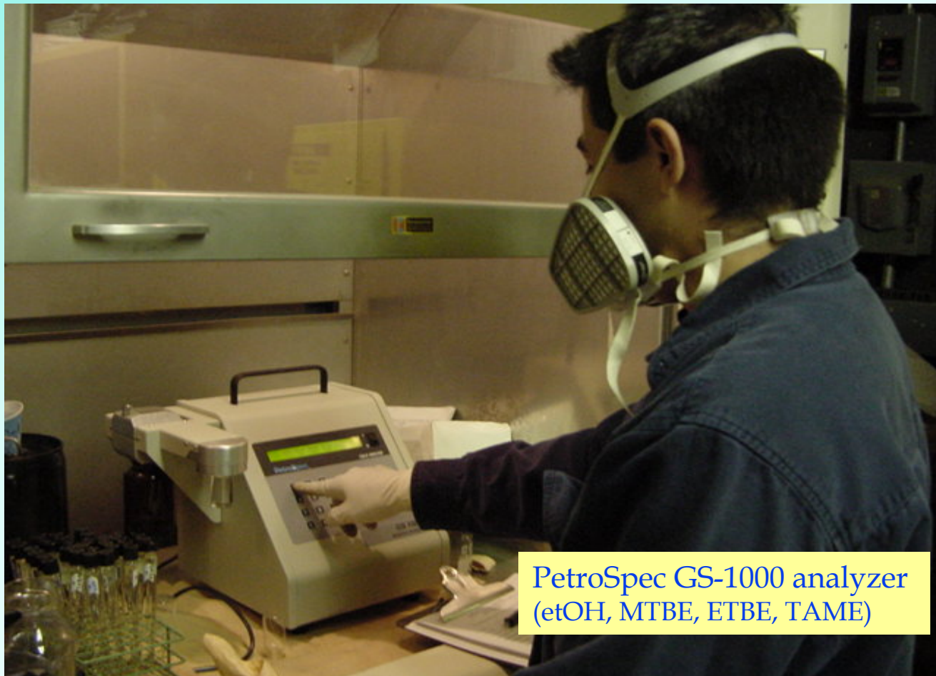
PetroSpec GS-1000 analyzer (etOH, MTBE, ETBE, TAME)